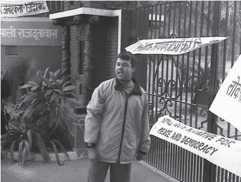
Jit Man participating in pro-democracy and human rights demonstration in front of the Nepalese embassy in New Delhi, India