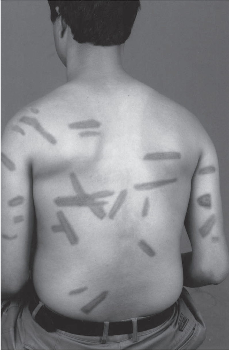
The bruises of torture in army custody